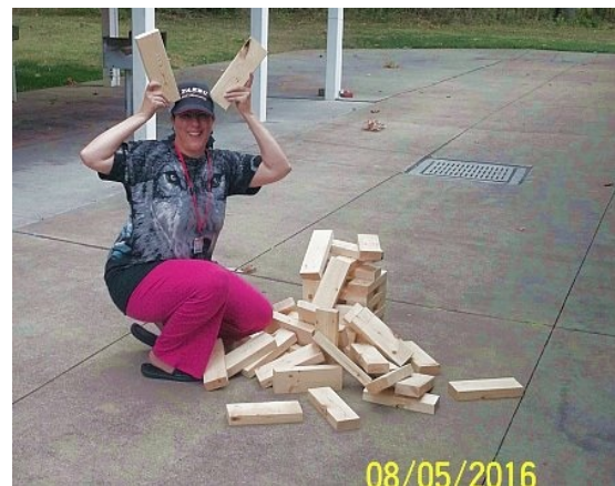
Giant Jenga wins again