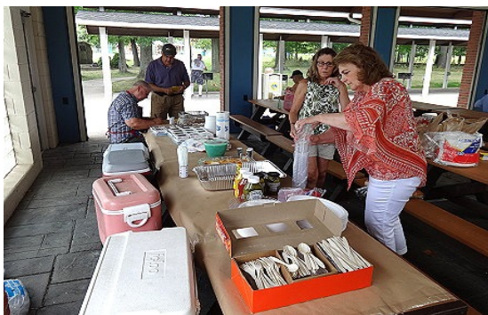
picnic food set up