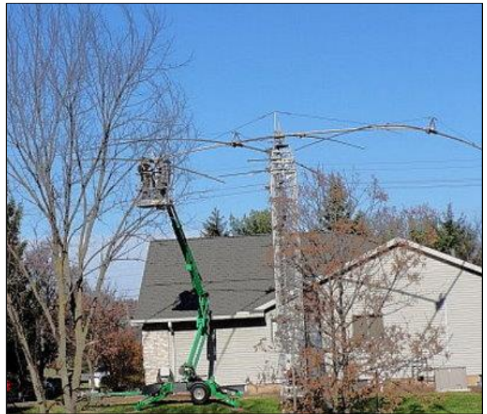
A good picture showing the scope of the job and crew working on Bob's antenna.

All is back to normal with the antenna; we also changed the coax and did a little maintenance on the tower. Always bad to be working on antennas in the winter.