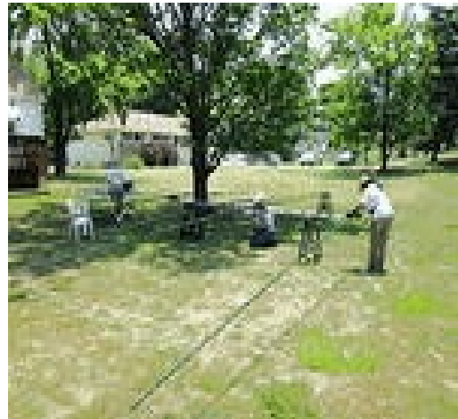
Assembling the SteppIR on the ground

This assembly took place on June 26 th and 27 th , a full 8 hours each day. As you might recall, these days had over 90 degree temperatures. I can attest to the fact that the heat did not deter these two retired engineers from building this antenna exactly as the instructions indicated. There was no short-cutting ! Between them they had every conceivable tool needed to do the perfect job. Ron’s antenna could not have been in better hands or built better !