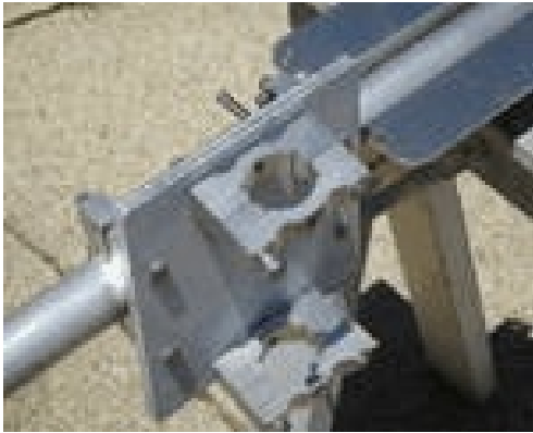
The “new & improved” replacement bracket