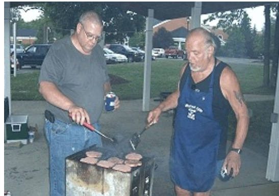
N8SRJ & WB8N flipping burgers

Check out the CARS website for more picnic photos by W8GC and NI8Z.